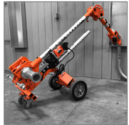
Customizable for each job site