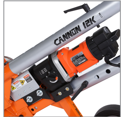
6 speed motor with reverse gear