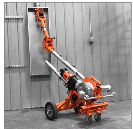
Use for overhead, underground, or side pulls

The fully self-contained, compact design of the Cannon 12K™ wire puller features the only 6-speed reversible motor that is sure to get even the heaviest pulls done in record time. Designed specifically for easy set up to meet job site demands, all parts store right on the puller. No gang box of parts needed. When extra extensions are used, the wire puller is capable of pulling out 13' of wire from the conduit opening. Gone are the days of pulling at only 6 feet per minute. iTOOLco's Cannon 12K™ pulls at speeds up to 48' per minute.