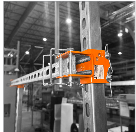
Easily Create Cross Member Structures