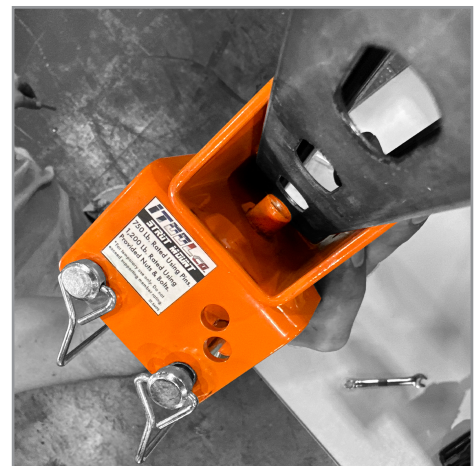
Stud Mount Locks Into & Captures Strut

Who doesn't hate using spring nuts? Strut installations are 2x faster with iTOOLco's Strut Mount System. Our new Strut Mount makes joining two struts together a snap. Adding cross members to strut structures or building new structures is simple. Determine the height of the cross strut, then install the bracket at that mark & you're done. Where existing spring nuts can slide out of place, making alignment of hardware a tedious task. The iTOOLco strut mount utilizes a "Stud Mount System" that places all the load between the welded stud of the bracket and the slot of the strut for easy & precise placement of cross members.