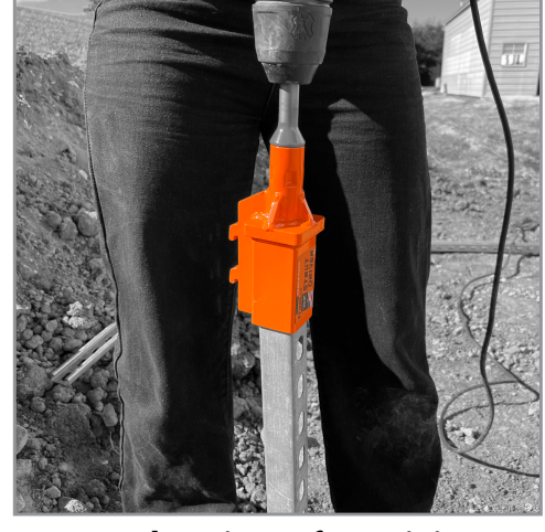
End Reciever for Driving from the Top

Safely drive your strut from ground level with iTOOLco's Strut Driver. The Strut Driver eliminates the need for climbing up ladders and using sledge hammers to drive stut into the ground. With both feet planted on the ground, plug the Strut Driver into your SDS MAX hammer drill. Then ensure the hammer drill is in hammer mode and drive it home. The unique engagement teeth allow users to drive strut sizes ranging from 1/2" to 1-5/8" from the side. Simply insert the engagement teeth into the strut, then drive. Once the strut is driven in far enough, move to the top of the strut to finish driving it to the final grade level. Note: The end receiver is designed to accept 1-5/8" size strut & up to 3/4" size rod. You can use the engagement teeth to sink other sizes below grade..