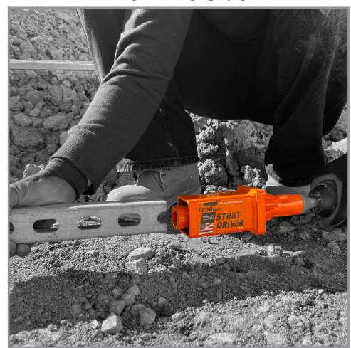
End Reciever Accepts 1-5/8" Strut

Safely drive your strut from ground level with iTOOLco's Strut Driver. The Strut Driver eliminates the need for climbing up ladders and using sledge hammers to drive stut into the ground. With both feet planted on the ground, plug the Strut Driver into your SDS MAX hammer drill. Then ensure the hammer drill is in hammer mode and drive it home. The unique engagement teeth allow users to drive strut sizes ranging from 1/2" to 1-5/8" from the side. Simply insert the engagement teeth into the strut, then drive. Once the strut is driven in far enough, move to the top of the strut to finish driving it to the final grade level. Note: The end receiver is designed to accept 1-5/8" size strut & up to 3/4" size rod. You can use the engagement teeth to sink other sizes below grade..