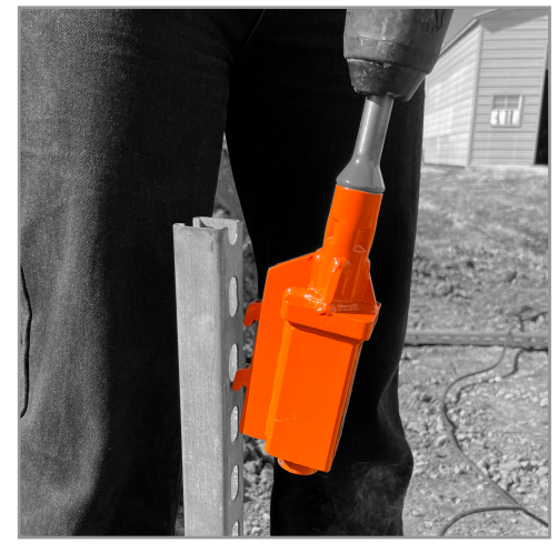
Engagement Teeth to Drive Strut From the Side