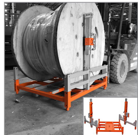
Forklift or Pallet Jack Compatible