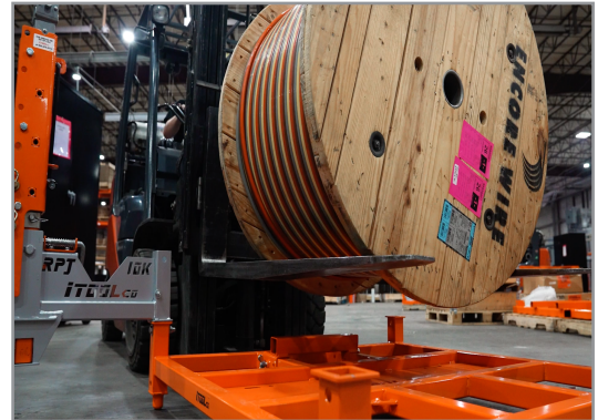
Dual Sided Loading Gates For Drum Side Loading

Added Bonus: Real Pallet Jacks collapse and stack for easy compact storage.