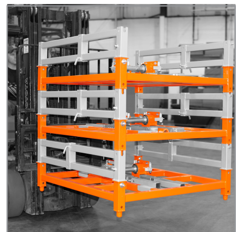
Collapsible & Stackable