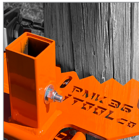
One Man Installation Point