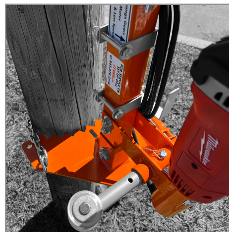
Engagement Teeth Bite Into the Pole

Now you can mount iTOOLco pullers to a pole! Pulling those remote overhead runs is easy with iTOOLco's pole mounted puller kit. The kit features a one man installation hook point. This unique hook point eliminates the need for two people to install the puller to the pole. Whether you want to pull at the high speeds offered by the Cannon 3K, or you have a little tougher work to do and need a 6,000 pound cordless puller, we've got your back. The kit works with both cordless and corded 3K & 6K models, giving you the ultimate flexibility.