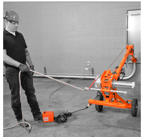
User stands to the side during pulls.