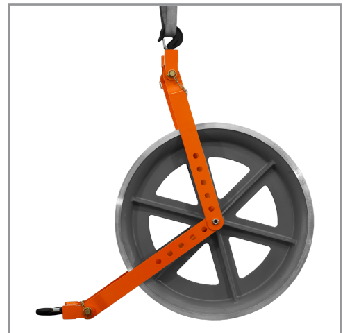
Extra Hook Accessory Available