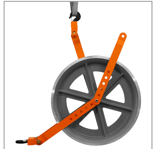
Easily Load & Unload