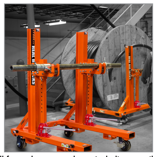
Pull from almost anywhere, including a trailer