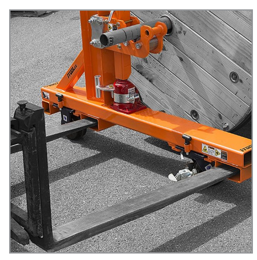
Lifting can be done from all four sides with forklift