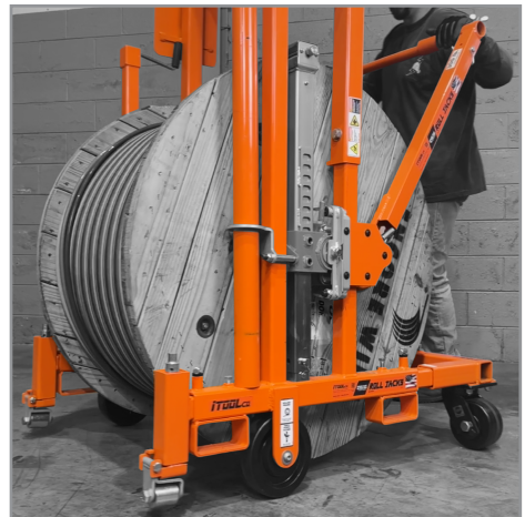
Heavy Duty Casters for Quick Transport & Positioning