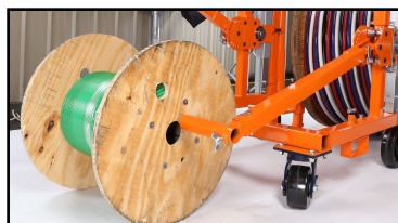
HANDLE HOLDS SMALL SPOOLS UP TO 300 LB