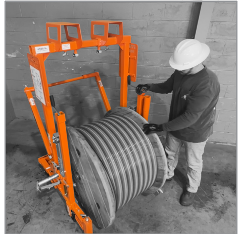
Load & Unload Spools on the Jobs Site

The Roll Jacks raise and lower spools in seconds with only a wrench or cordless drill & socket. Keeping transportation in mind, the Roll Jacks are equipped with forklift pockets both beneath and above the spool. The innovative design also allows the handle to be utilized for lifting smaller spools & ground wire up to 300 lbs.