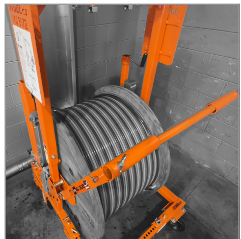
Easy Payoff of Reels up to 6,500 lb