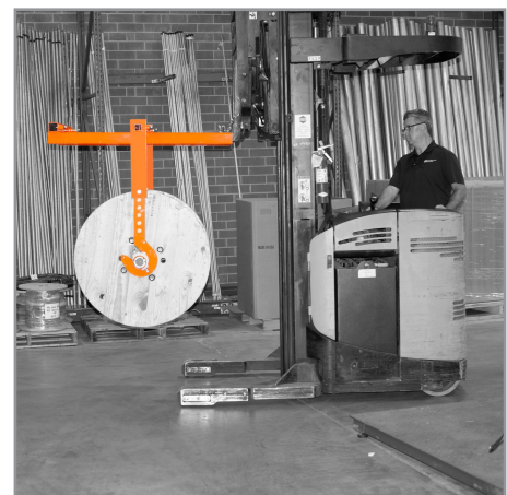
Load hanging center can be moved for heavy loads