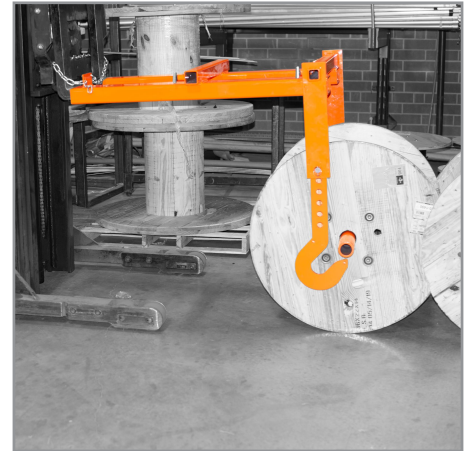
Spool axle nests safely in hook during transport