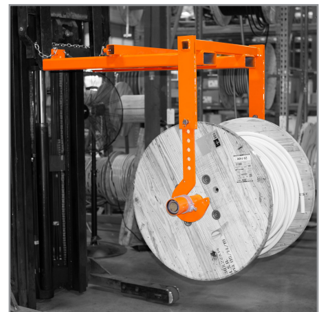
Adjustable width & length to accommodate a wide variety of spools