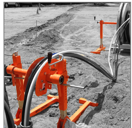
Great companion tool for iTOOLco's Real Jacks™

Rounding curbs, edges, or pipes on wire pulls has never been easier. With iTOOLco's Curb Rollers™, wire rides on multiple bearinged rollers for a smooth feed around any sharp corner. Perfect for many different pulling and feeding situations - curbs, manholes, in and out of electrical boxes - the specialized roller design makes the tool perfect for most jobsite applications.