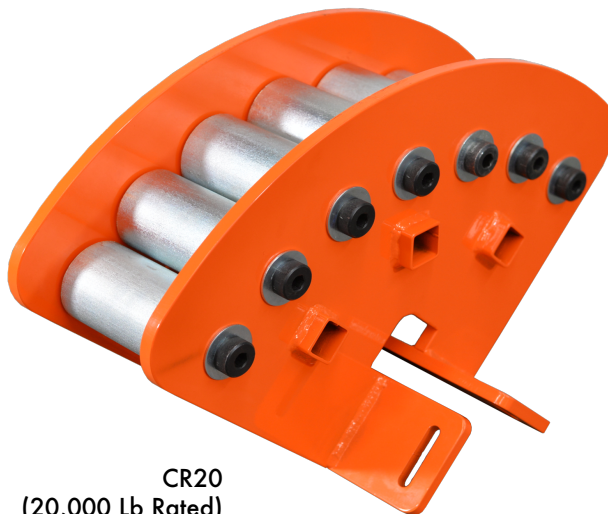
CR20 (20,000 Lb Rated)