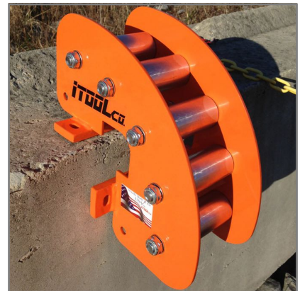
Will roll rope or wire over any edge

Rounding curbs, edges, or pipes on wire pulls has never been easier. With iTOOLco's Curb Rollers™, wire rides on multiple bearinged rollers for a smooth feed around any sharp corner. Perfect for many different pulling and feeding situations - curbs, manholes, in and out of electrical boxes - the specialized roller design makes the tool perfect for most jobsite applications.