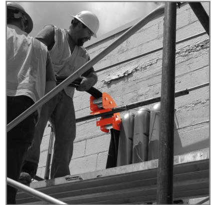
Mounts over 2" rigid pipe