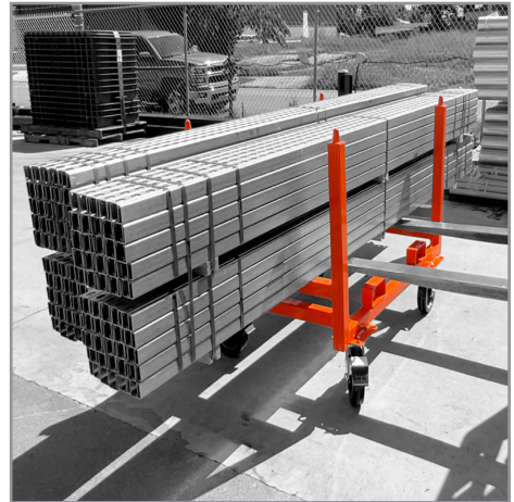
Load & Unload Bundles With a Forklift