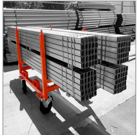
Can Hold Loads Up To 3,700 Lb.

iTOOLco's Heavy Duty Strut Cart™ is the perfect solution for storing and transporting large bundles of strut with ease. Capable of holding up to 3,700 lbs. the built-in forklift pockets allow for jobsite delivery and mobility. The Heavy Duty Strut Cart is designed with a Stable H-Design & has clearance below the load and side rails, enabling the strut to be loaded or unloaded via forklift. The stackable design also maximizes your storage footprint. Meanwhile the forklift pockets double as tie down slots - meeting the Federal Motor Carrier Safety Administration's standards for strapping loads down.