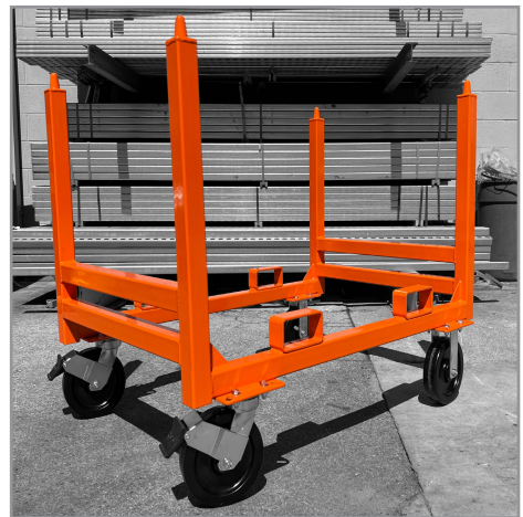
Stackable & Forkliftable Design

iTOOLco's Heavy Duty Strut Cart™ is the perfect solution for storing and transporting large bundles of strut with ease. Capable of holding up to 3,700 lbs. the built-in forklift pockets allow for jobsite delivery and mobility. The Heavy Duty Strut Cart is designed with a Stable H-Design & has clearance below the load and side rails, enabling the strut to be loaded or unloaded via forklift. The stackable design also maximizes your storage footprint. Meanwhile the forklift pockets double as tie down slots - meeting the Federal Motor Carrier Safety Administration's standards for strapping loads down.