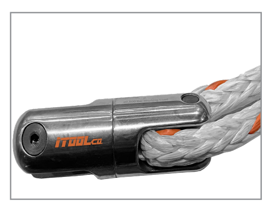
Protects pulling eye