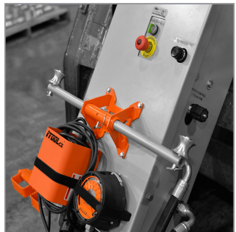
Control Your Pulling Force Using the Output Torque Limit Dial