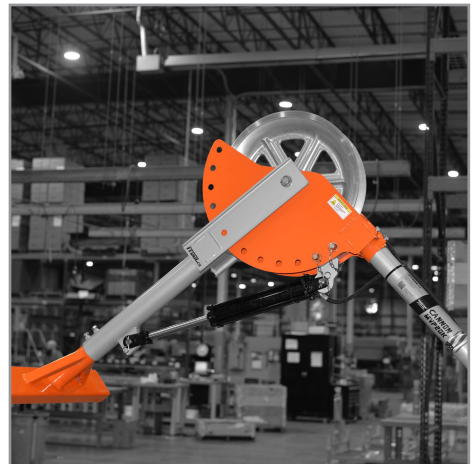
Hydraulic Adjustment of Extensions

Designed to handle your toughest pulls, iTOOLco's Hydraulic MVP20K is sure to meet any challenge. The fully self-contained unit attaches to any high flow skid steer, providing long awaited jobsite mobility.