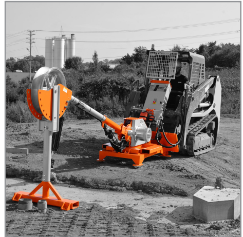
Attaches to Any High Flow Skid Steer