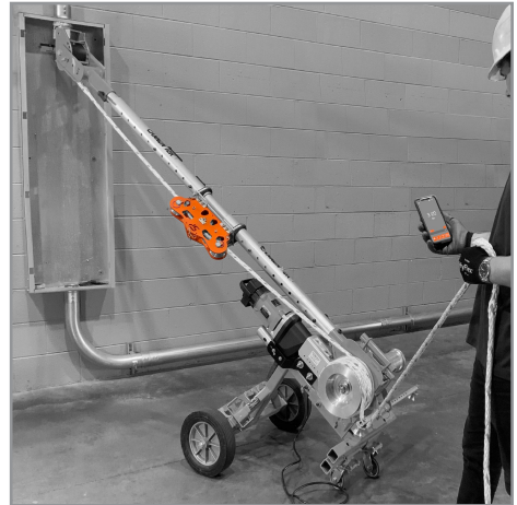
Overhead & Right Angle Pulls