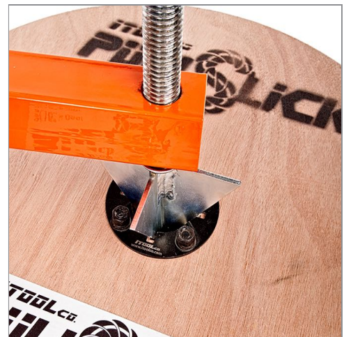
Axle-less technology makes loading and unloading easy.

The iTOOLco Real Tender™ is a smarter rope tender that rolls over rough terrain on the job site. Lightweight and maneuverable, it's easy for one person to set up and transport - and it prevents rope-lifting and handling injuries. With an axle-less technology, the Real Tender™ is multi-directional and can be used horizontally or vertically making it flexible on the job. The crank handle makes re-spooling significantly faster. The Real Tender™ also keeps expensive rope high and dry.