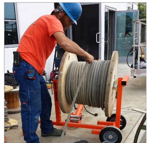
Re-spool faster than ever.

The iTOOLco Real Tender™ is a smarter rope tender that rolls over rough terrain on the job site. Lightweight and maneuverable, it's easy for one person to set up and transport - and it prevents rope-lifting and handling injuries. With an axle-less technology, the Real Tender™ is multi-directional and can be used horizontally or vertically making it flexible on the job. The crank handle makes re-spooling significantly faster. The Real Tender™ also keeps expensive rope high and dry.