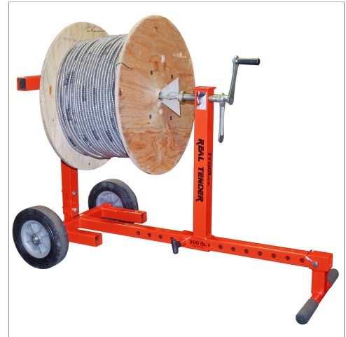
Great for moving MC Cable.