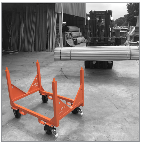
Easy to load.