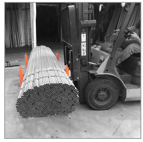
Up to 3,700 lb. load capacity.