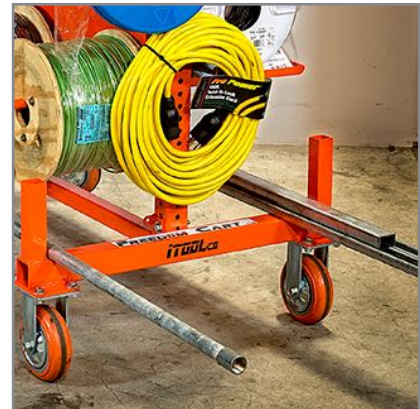
Conduit and strut store easily on the lower frame.