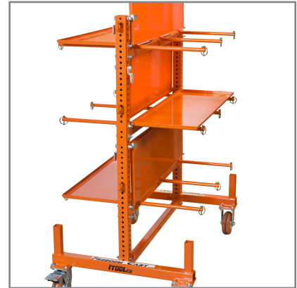
Shelves fold up and store away.