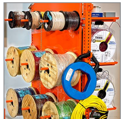
Holds wire packs and data boxes.

iTOOLco's Freedom Cart™ keeps valuable wire and materials organized, visible, free of damage, ready for use, and makes for easy transporting anywhere. Constructed of top grade steel, wheels, and powder coating, the Freedom Cart is built for years of flawless service. The six shelves fold up or stay down, and adjust up and down for spacing in countless configurations. In addition, there are 18 spool axles and a lower pipe rack. Perfect for roughing-in or for any phase of the job, from start to finish. The shelves hold up to 36 wire packs or data boxes. The axles carry up to 36/each of 500' wire spools, or 18/each of 2500' wires spools, and a load of pipe, strut, and threaded rod.