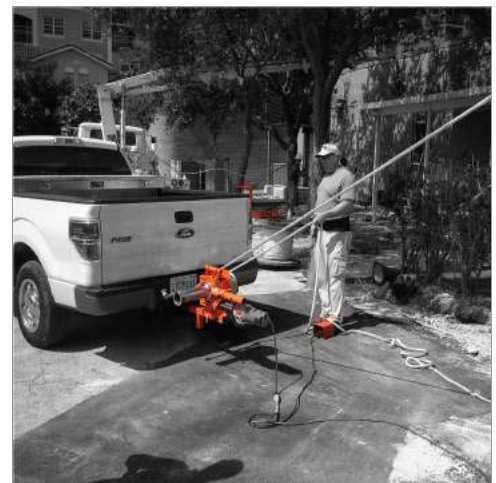
Compatible with receiver hitches.