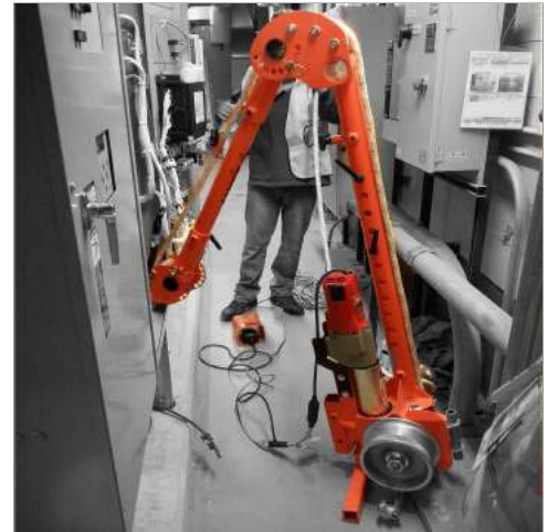
Versatile enough to fit in small spaces.