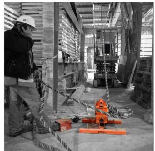
User stands to the side during pulls.