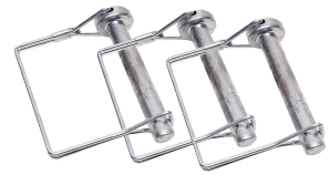
SP-181 LOCKING UNDERPINS Three each included