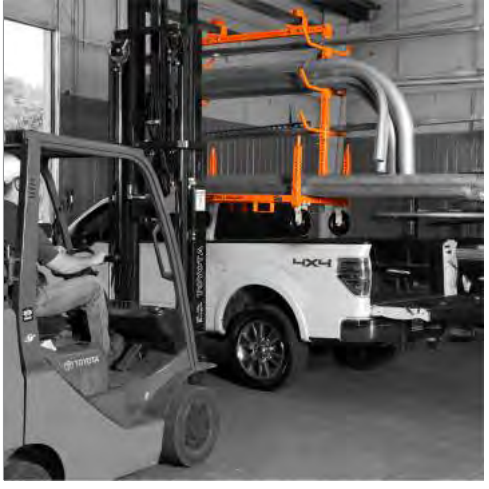
Easy to Transport Loaded