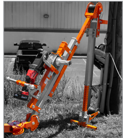
Stable footprint design