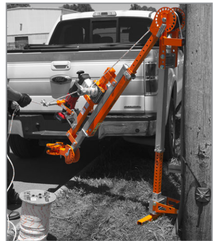
Boom articulates for underground applications

Get high-speed performance on unique set-up challenges with iTOOLco's Dual Capstan Cordless 3K Utility Puller™. Designed for quick set-up, the Cordless 3K Utility Puller's articulating receiver adapter can be positioned 180° vertically or horizontally at the precise angle needed to get the job done. The four speed dual capstan pulls 18' & 50' (per min) on low speed and 40' & 108' (per min) on high speed with a built in reverse gear.