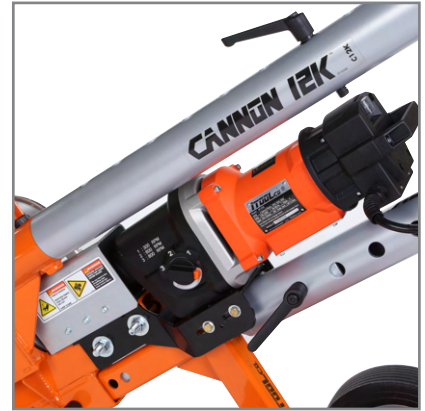
6 speed motor with reverse gear