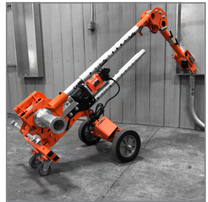
Customizable for each job site