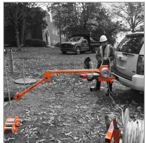
Compatible with receiver hitches.