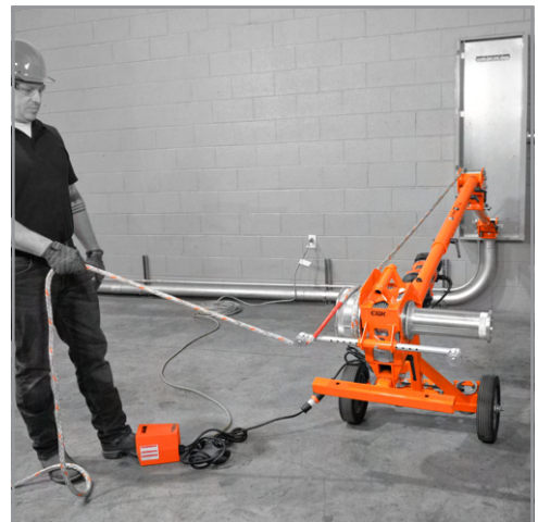
User stands to the side during pulls.