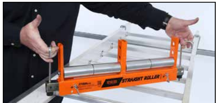
Compatible with other systems.