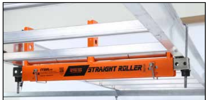
Roller clamps to rung, strut, or I-beam. Simply tighten the bolt onto supporting member and install locking underpins.

*Check tray manufacturer specs for maximum capacity.